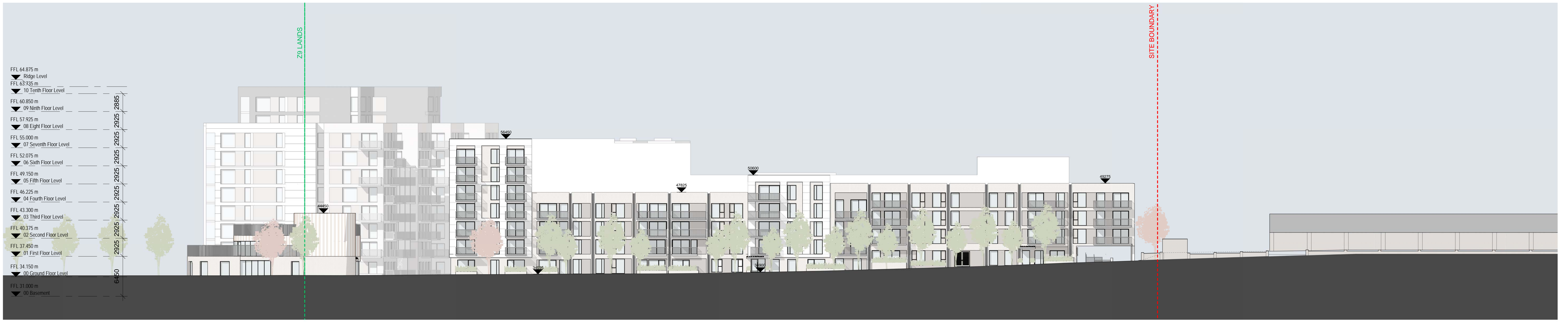
1 Section 8 1 : 250

GYM, Creche & Cafe Building Block B Mr Price, Coolock Drive