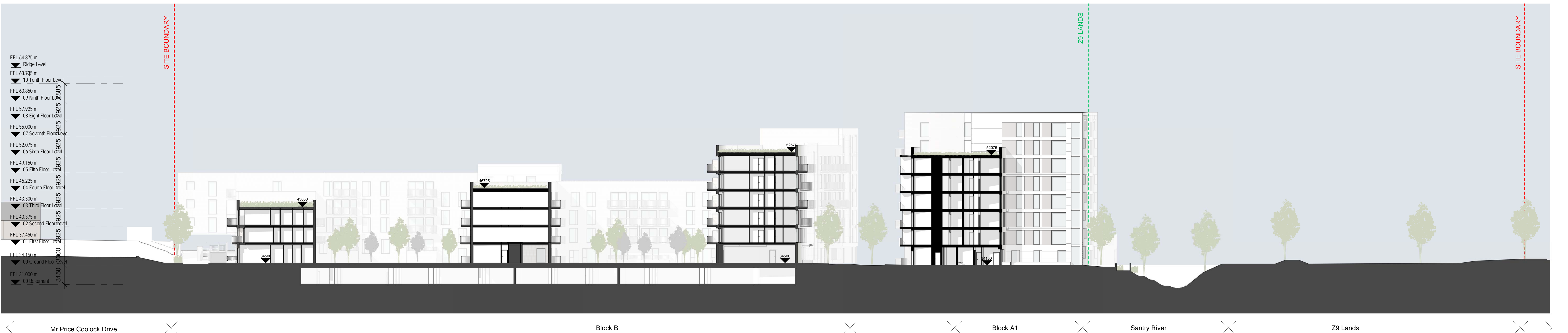
Section 7 1 : 250