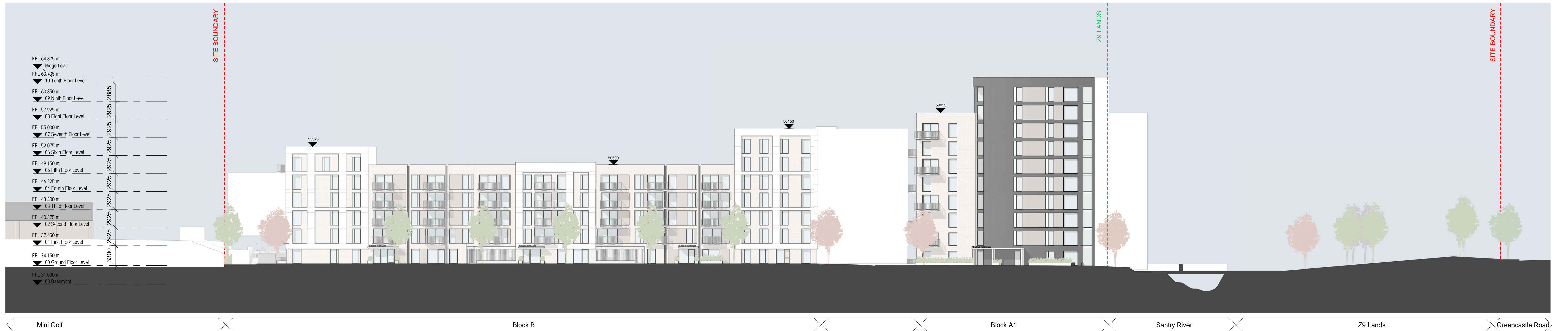
Section 6 1 : 250