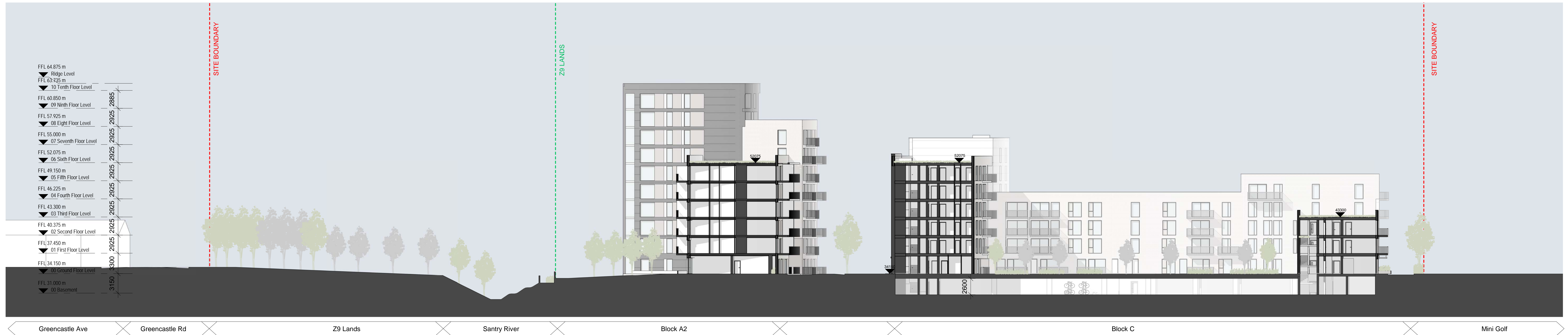
4 Section 4 1 : 250