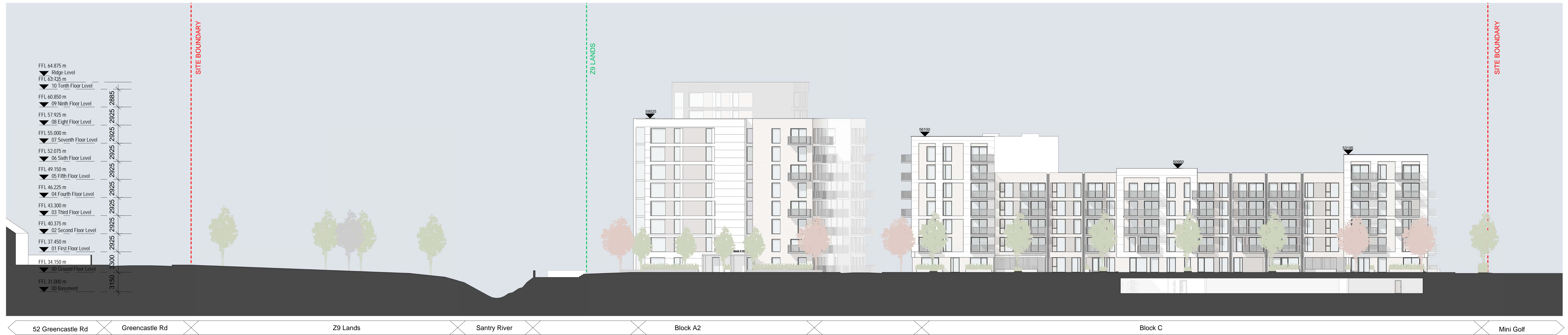
5 Section 5 1 : 250