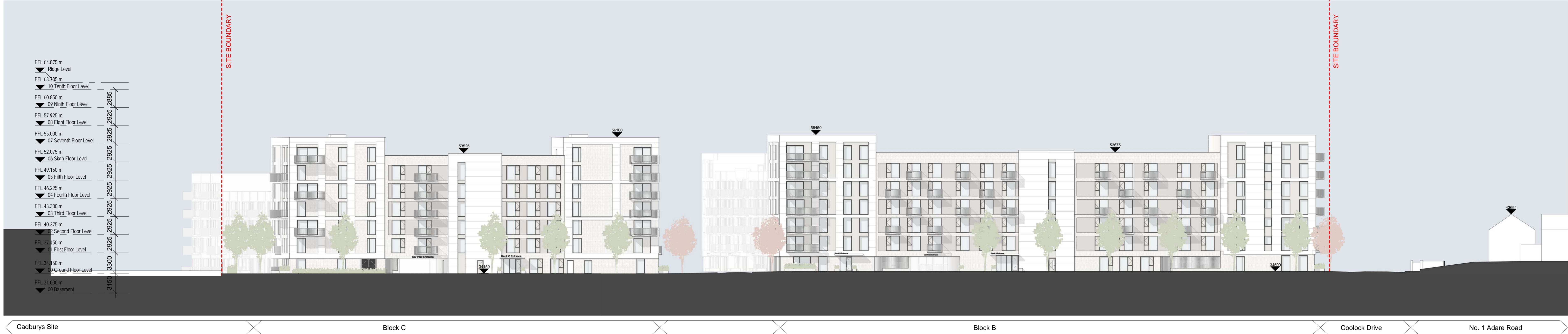
2 Section 2 1 : 250