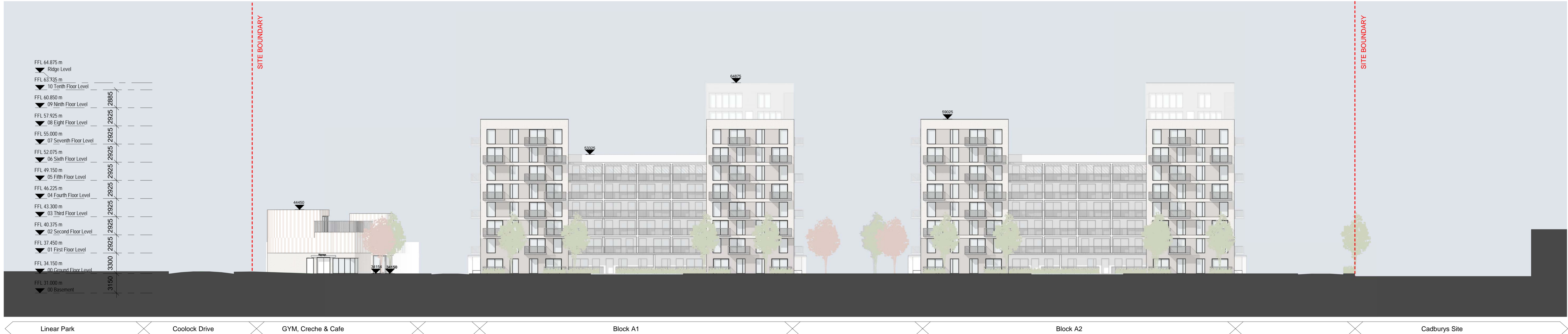
3 Section 3 1 : 250