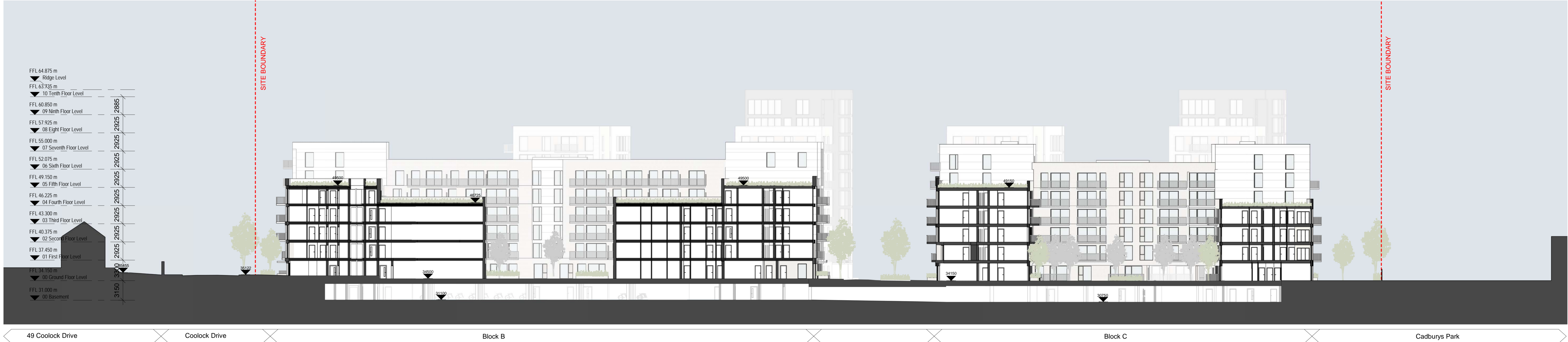
1 Section 1 1 : 250