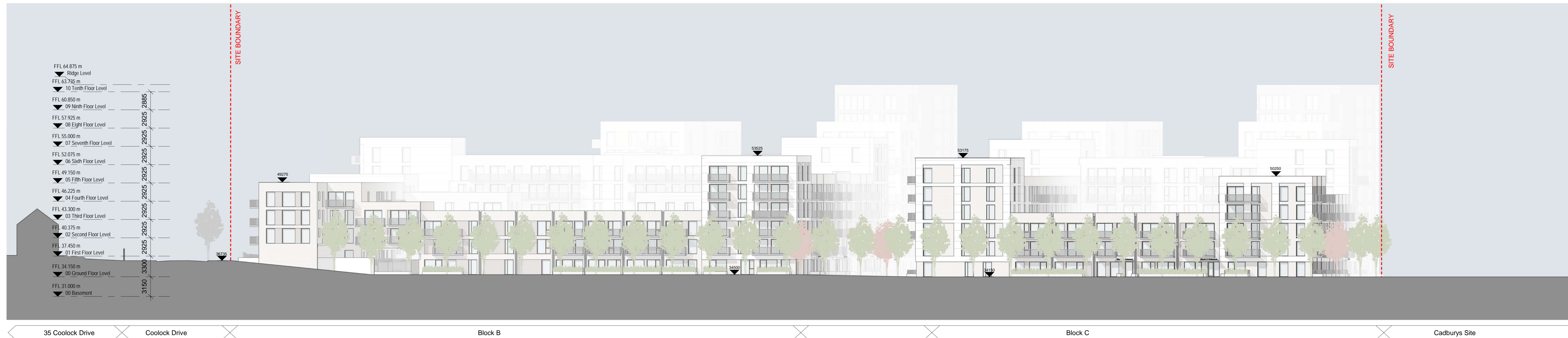
2 Elevation SW 1 : 250