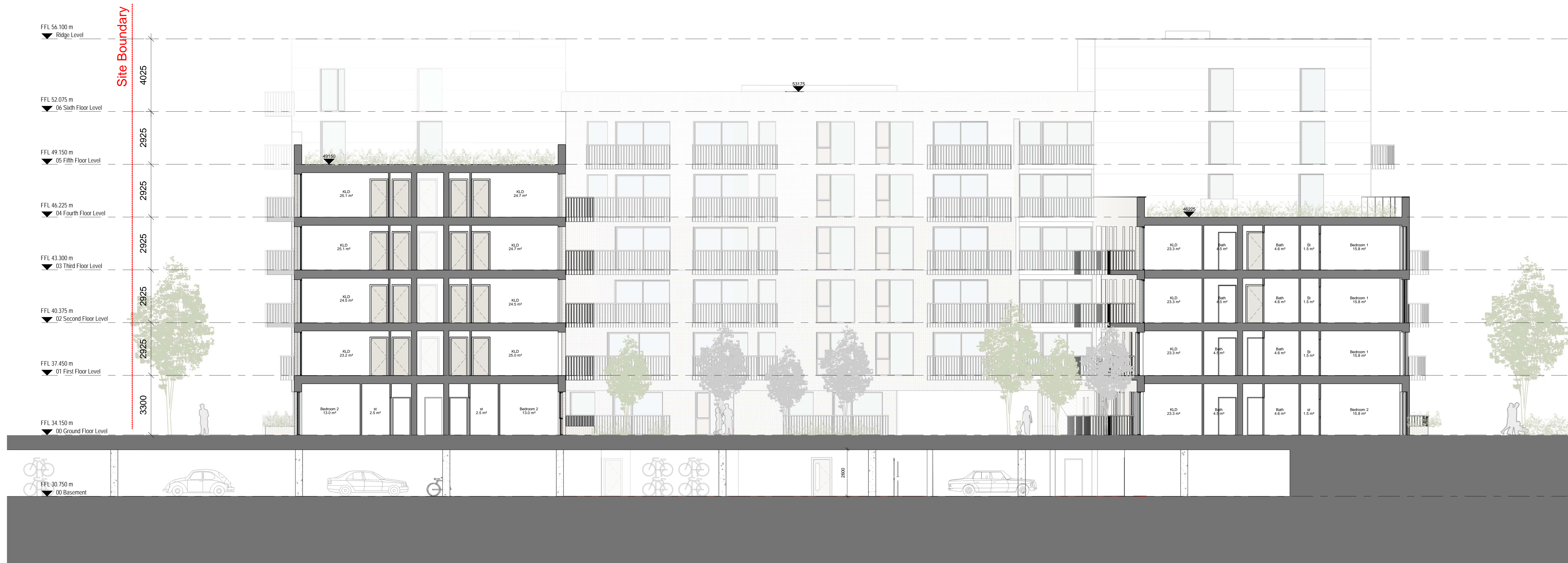
1 Cross Section B 1 : 100