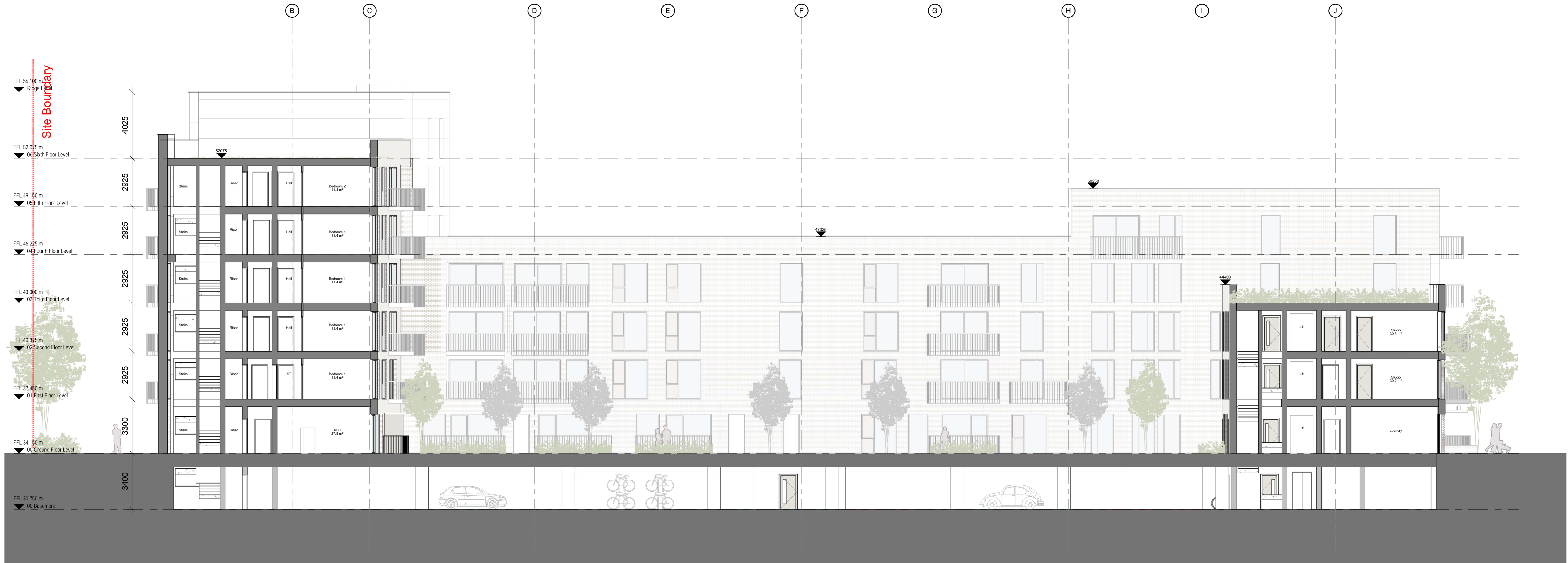
1 Cross Section A 1 : 100