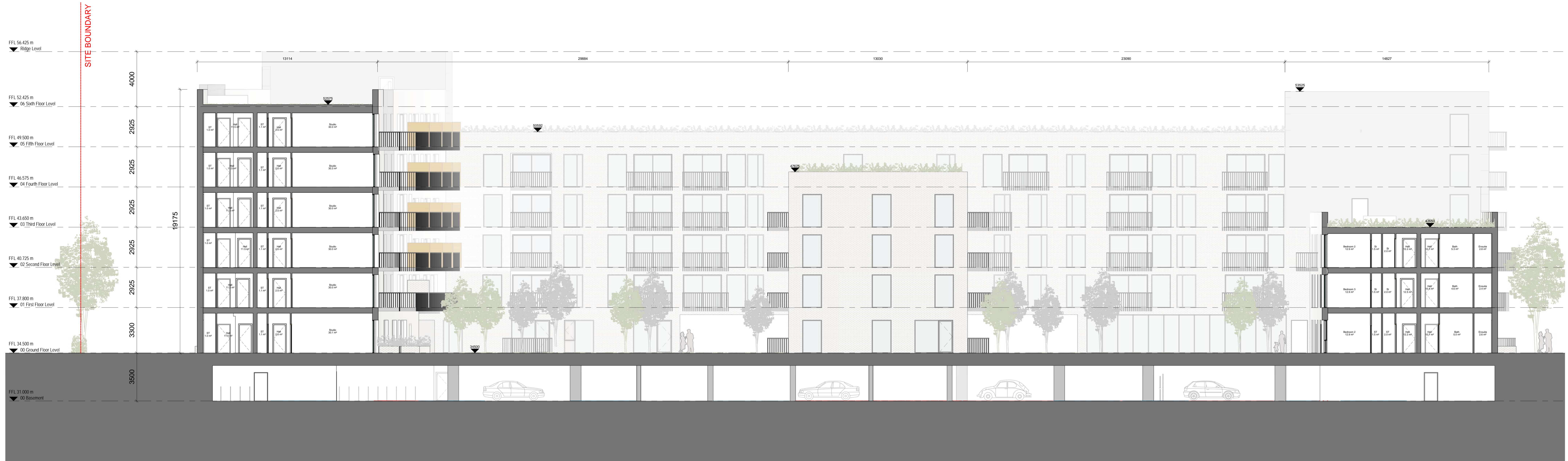
1 Cross Section A 1 : 100