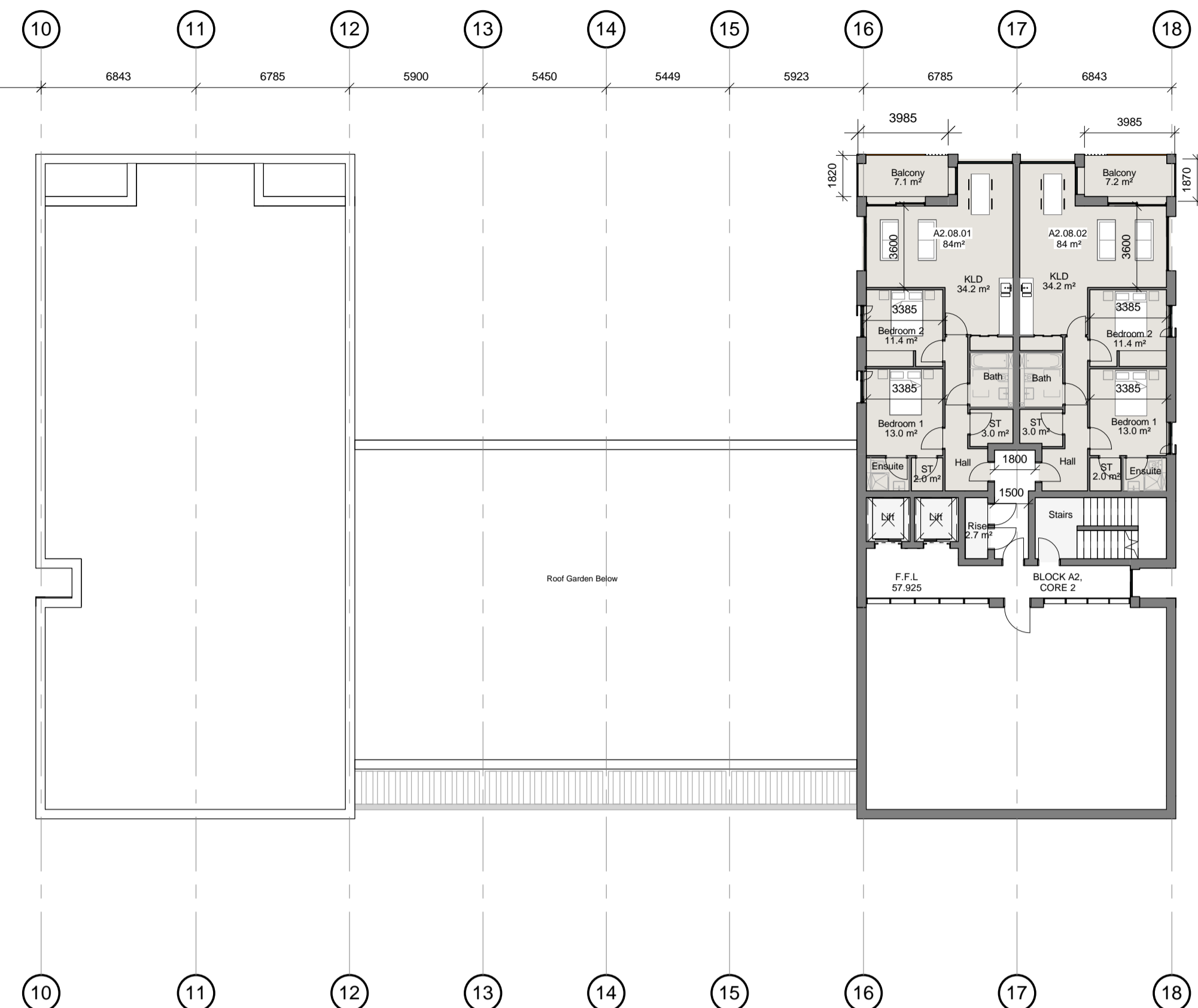
1 08 Eight Floor Level 1 : 200