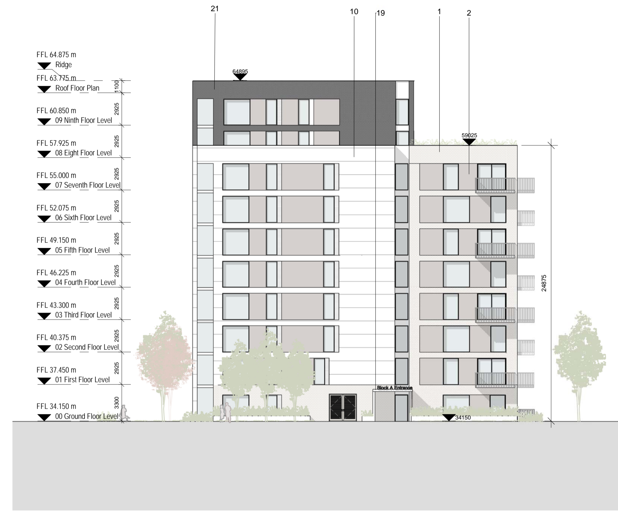
2 Elevation NW 1 : 200

NOTES: Copyright of this drawing is vested in the Architect and it must not be copied or reproduced without consent. Figured dimensions only are to be taken from this drawing. All dimensions must call out and be responsible for using and checking all dimensions relative that work. PLCE Architecture are to be advised of any variation between 000 MET SCALE AND 1000 DIMENSIONS. IN ACCORDANCE