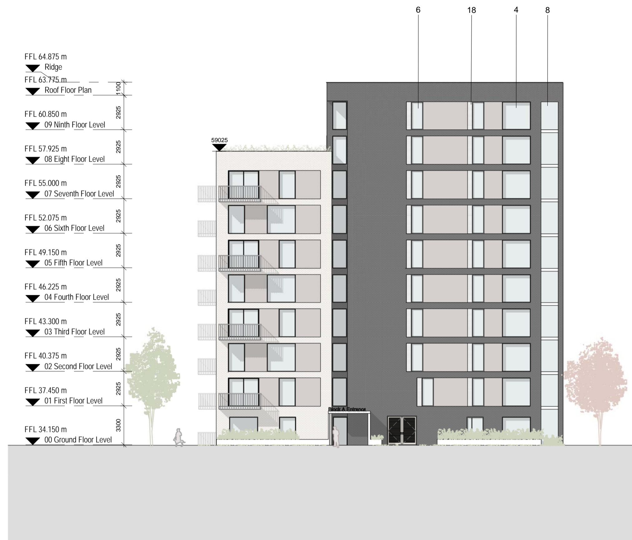
1 Elevation SE 1 : 200