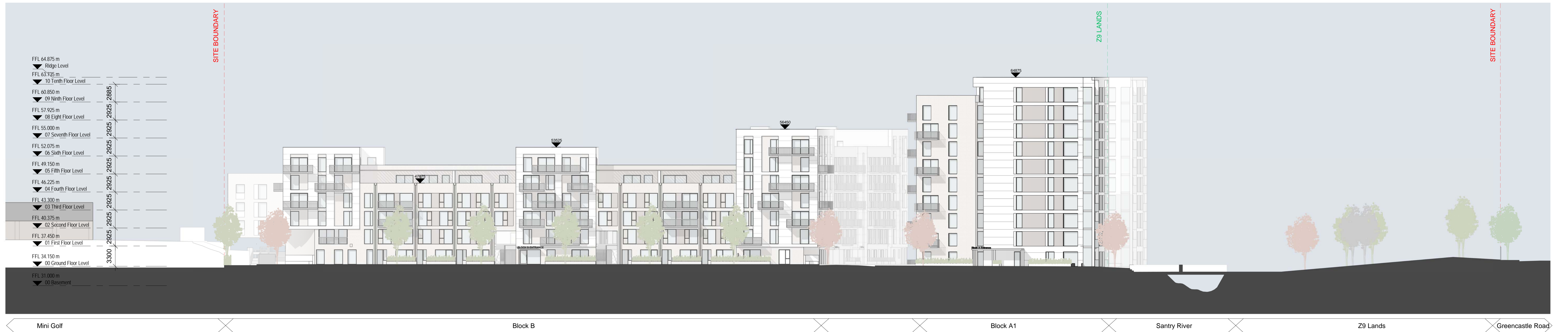
Section 6 1 : 250