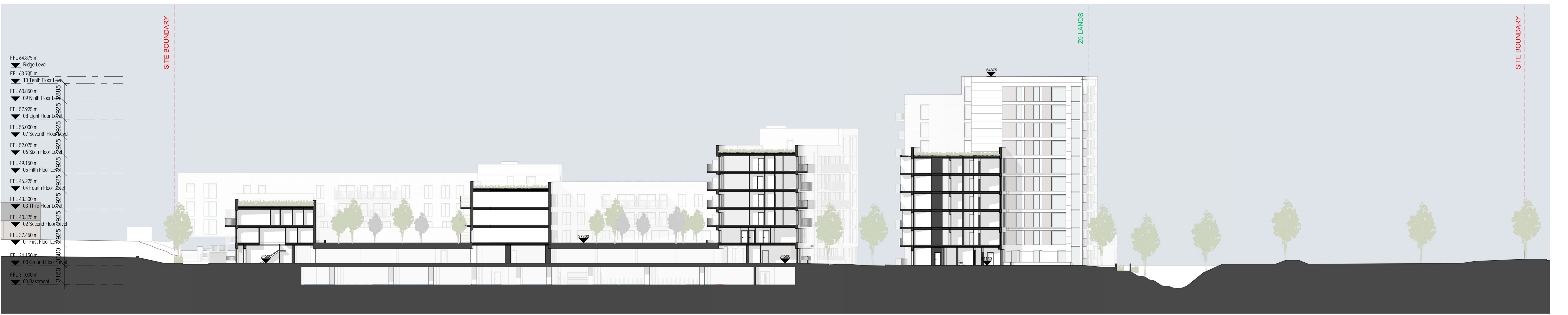
Section 7 1 : 250