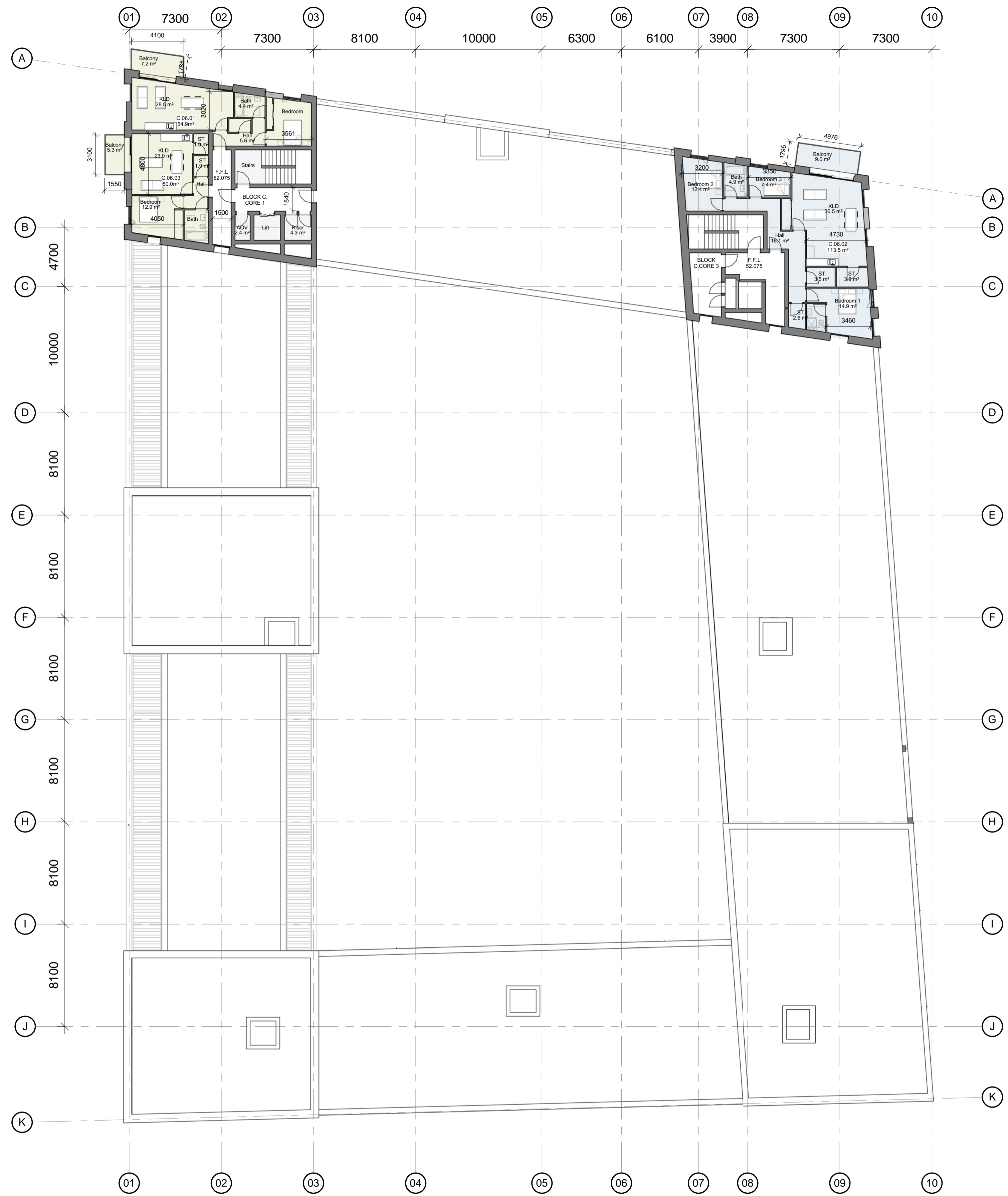
1 06 Sixth Floor Level 1 : 200