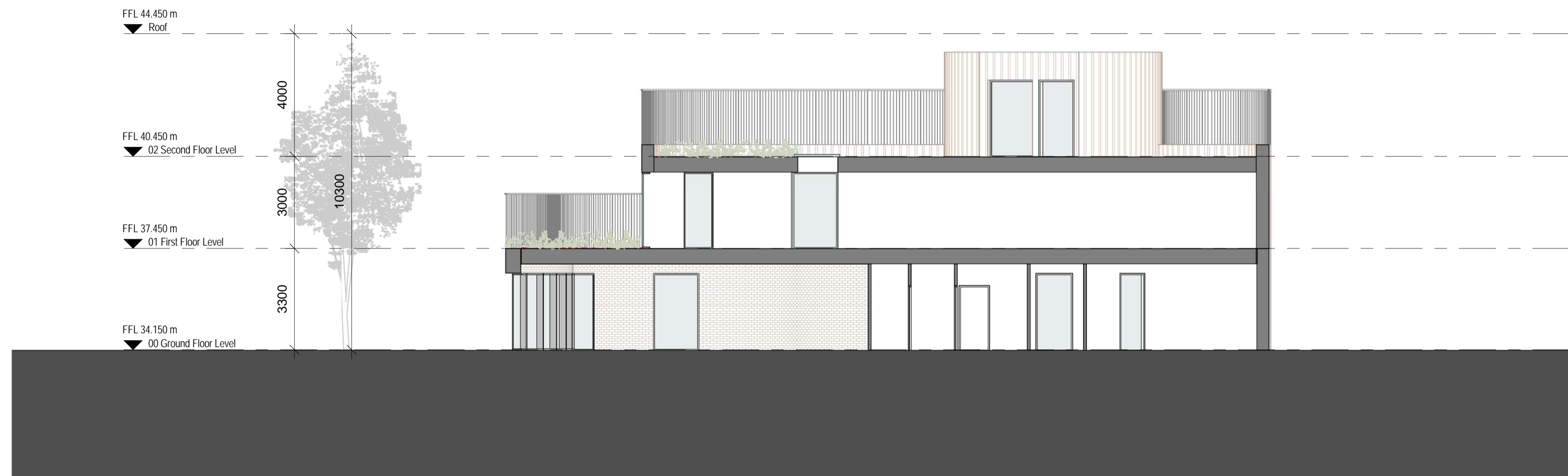
1 Cross Section A 1 : 100