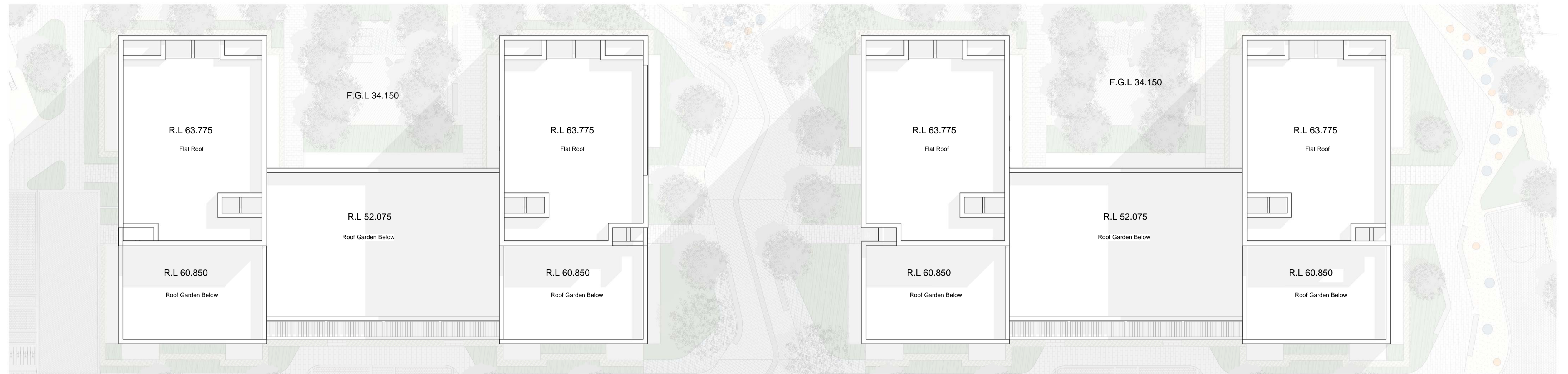
1 Roof Floor Plan 1 : 200